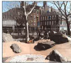
Chelsea's dog run has good drainage and is a haven for hide and seek in the natural and man-made rocks.

In 1996, dog owners, who had met every day at the park while bringing their dogs to play off-leash on a patch of grass, formed a community to pitch the Parks Dept. They succeeded in getting a fence. Today an estimated 150 owners bring dogs on weekdays—double on weekends. Neighborhood business donations and volunteer workers keep this run in shape.