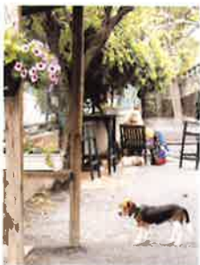
After 4 years of lobbying, this once-vacant lot in Hell's Kitchen became Astro's Dog Run, named after the beloved canine companion of the leader in the effort.