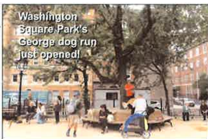
Washington Square Park's George dog run just opened!