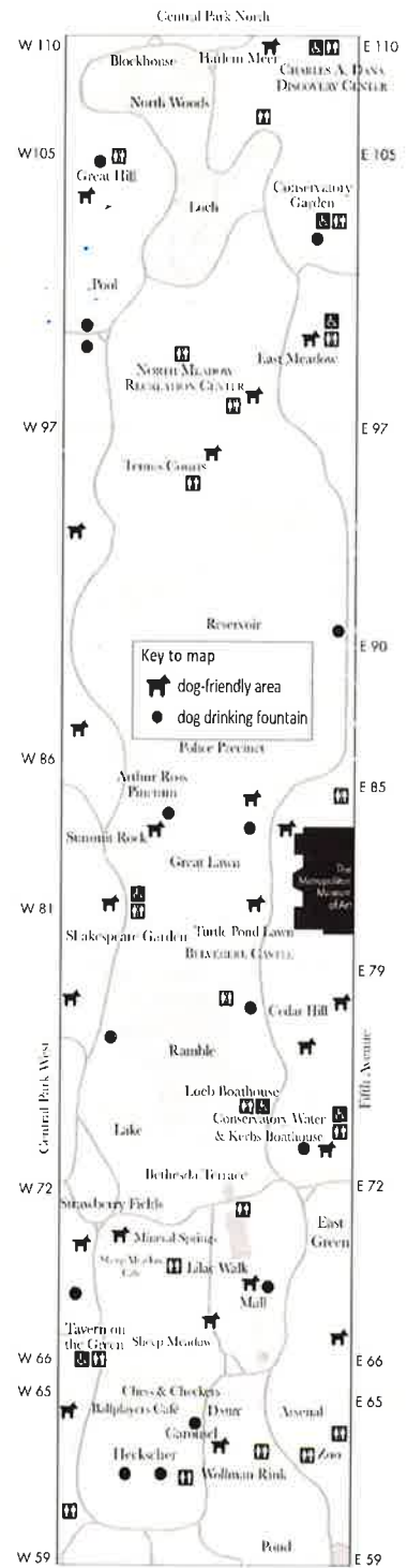
Central Park: During designated hours (6 a.m. to 9 a.m. and 9 p.m. to 1 a.m.), Central Park has 23 off-leash, unfenced areas and 15 dog drinking fountains.